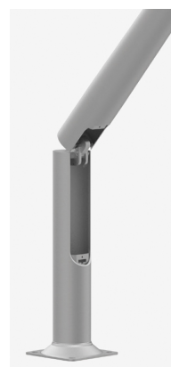
3. Manually lowering the column

* Cradle to Cradle Certified® at Silver level applies only to products without the optional elastomer protection. Cradle to Cradle Certified® is a registered trademark of the Cradle to Cradle Products Innovation Institute.