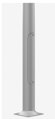
1. Removing the door